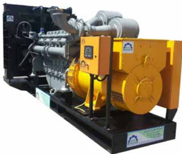
Generating Set pictured may include optional accessories