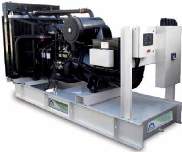
Generating Set pictured may include optional accessories