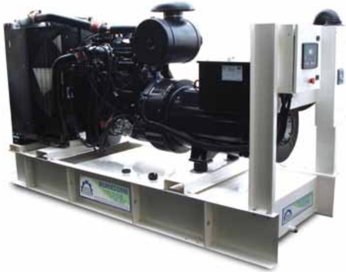
Generating Set pictured may include optional accessories