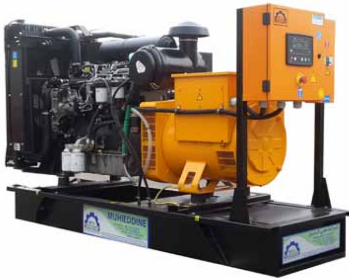
Generating Set pictured may include optional accessories