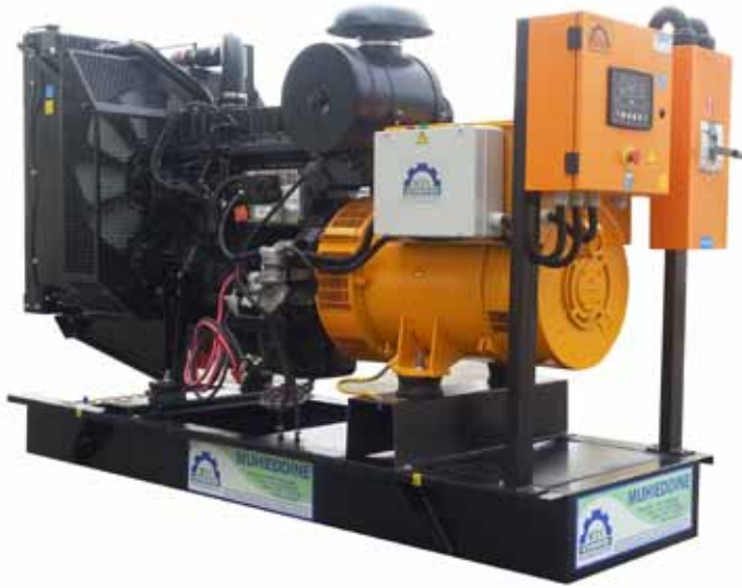
Generating Set pictured may include optional accessories