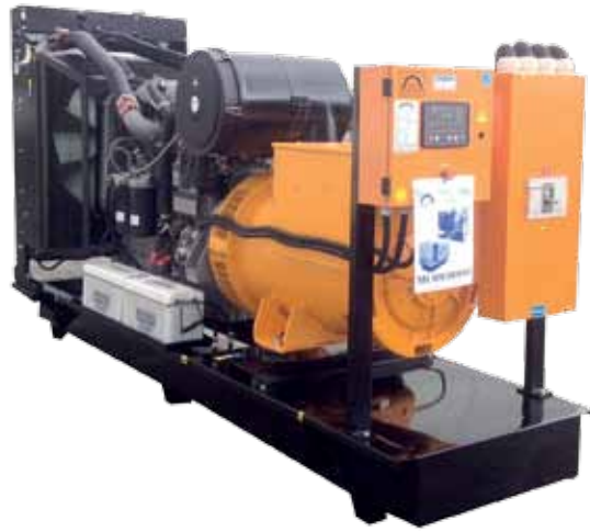
Generating Set pictured may include optional accessories