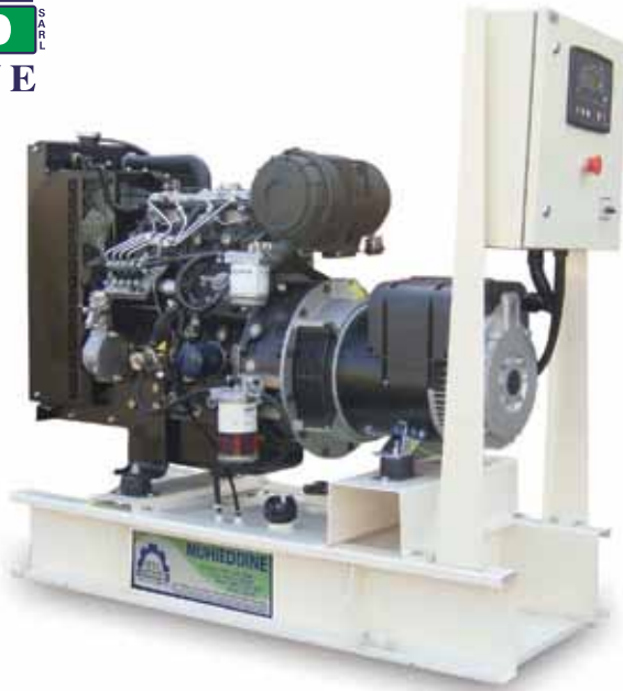
Generating Set pictured may include optional accessories