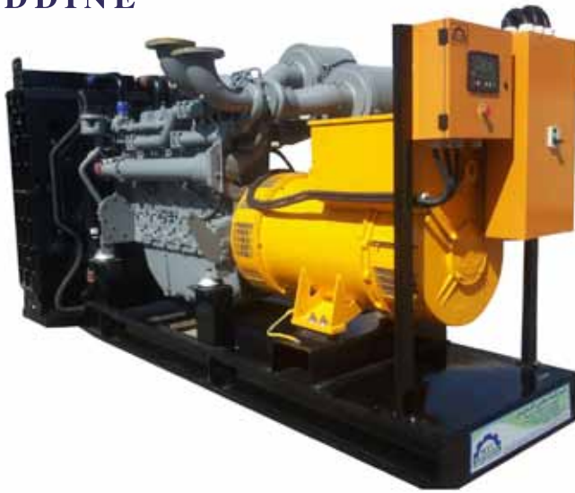
Generating Set pictured may include optional accessories