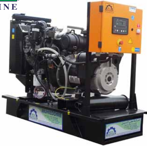
Generating Set pictured may include optional accessories