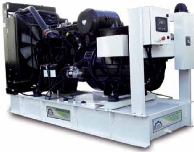
Generating Set pictured may include optional accessories